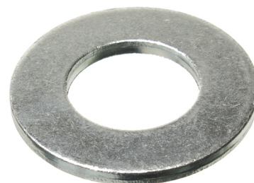
0.140" FLAT WASHER

To use pitman arm RP20609 and RP20610 with a support bracket kit: